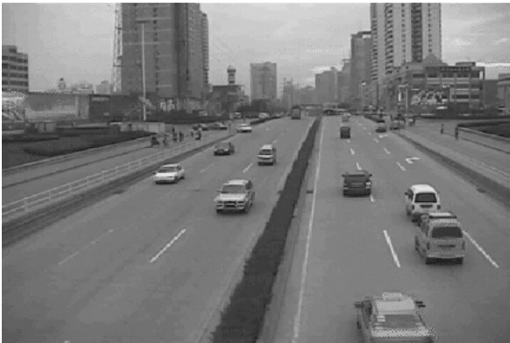
Fig.1 frame k

Fig.1 to Fig.3 shows three continuous frames in a video sequence. According to BIF assumption in condition (1) , video scene background in surveillance is larger in size than vehicle; it is almost still and has little change in color during a short period of time. The intact background is always unknown since it is stained by moving vehicles frequently, and it also changes slowly with the atmosphere condition and environmental changes. To simplify the description, we use a group of schematic diagrams showed in Fig.4 to make it clear.