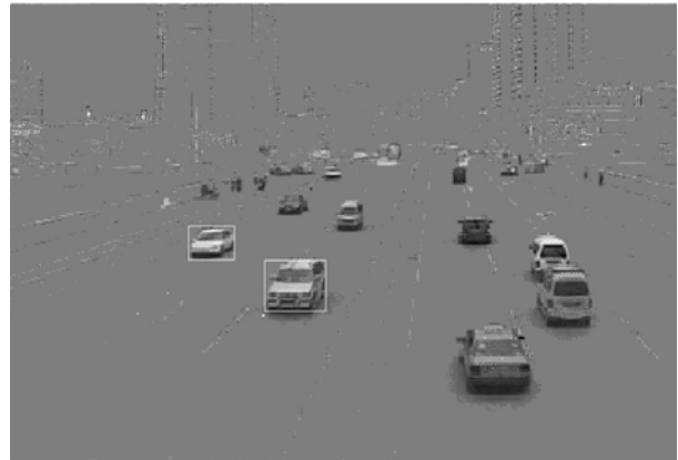
Fig.7 Tracking result based on Background differencing and temporal coherence of target

BIF is not only a method, but also a new viewpoint when tackle the challenges and difficulties in video target extraction. Most of available tracking techniques are target