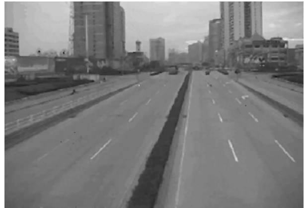
Fig. 5 BIF result by fusion of different frames

On one hand, if it is set to a small number, that means the fusion decision speed is fast, the smaller the AssureCount, the fewer the frames required to decide the background color of a specific position.