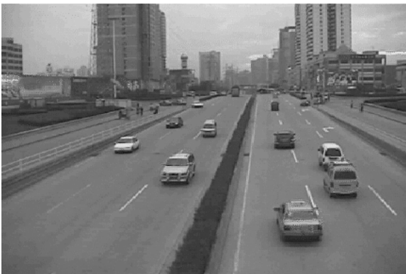
Fig.2 frame k+1