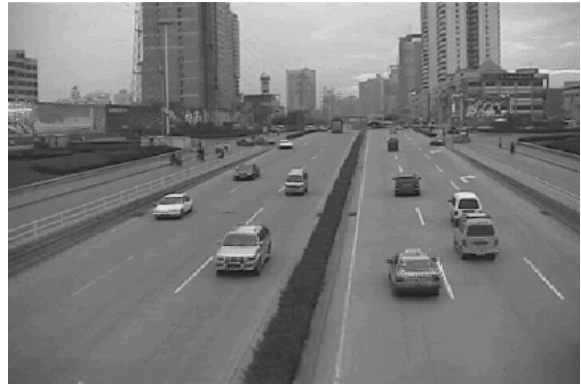
Fig.3 frame k+2

. ⊗ mark in Fig.4 stands for background image point which is not stained by target, △ mark stands for background point which is stained by target, or target point which is varied on the background image.